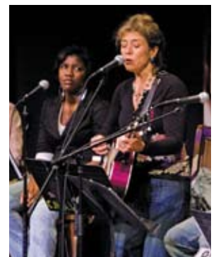
The Freedom Sings band performs.

Freedom Sings is a critically acclaimed multimedia experience with an all-star cast of musicians. The presentation features music that has been banned or censored or has sounded a call for social change, and it invites audiences to take a fresh look at the First Amendment. This entertaining, irreverent and inspiring program is packed with live music and video, showcasing hit songwriters and Grammy Award winners devoted to sharing the power, passion and poetry of music.