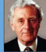
John Seigenthaler Founder

The First Amendment Center was founded by John Seigenthaler on Dec. 15, 1991, the 200th anniversary of the ratification of the Bill of Rights to the U.S. Constitution.