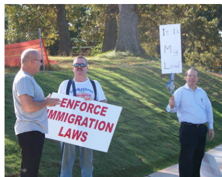
Anti-immigrant activists champion nativist attitudes in Cobb County. The sign held by the man on the right reads: "It is My Land."

There is no meaningful check in place to ensure that local law enforcement do not abuse the program by intimidating and racially profiling immigrant communities in Cobb County. A Government Accountability Office (GAO) investigation earlier this year found that ICE was not exercising proper oversight over local or state agencies. This problem is compounded in Georgia, as there is currently no state legislation banning racial profiling and mandating accountability and transparency for law enforcement. In addition, complaint mechanisms provided in the MOA have not been at all publicized in Cobb County and community members are unaware of their existence.