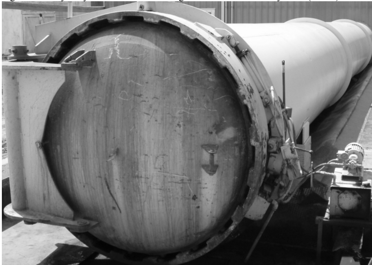
Figure 1. Heavy Duty Wood Preservative High Pressure Treatment Cylinder (Retort)

Again, due to the unique nature in which heavy duty wood preservatives are applied, wood preservative risk assessment requires a different approach than those used for standard agricultural or antimicrobial pesticides. For example, unlike agricultural pesticide handlers who may be exposed to pesticides when mixing/loading, applying, or re-entering an area treated with