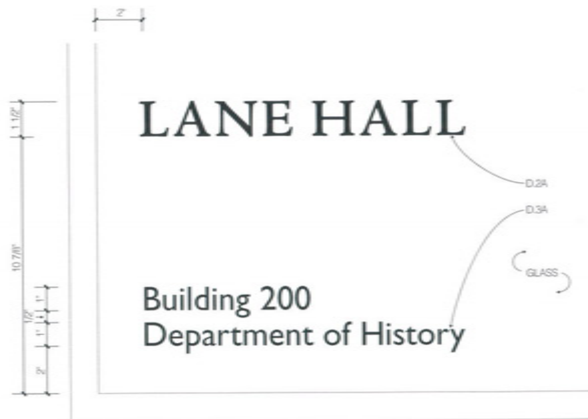
1 Sign Types D.2A, D.3A Type Layout 1