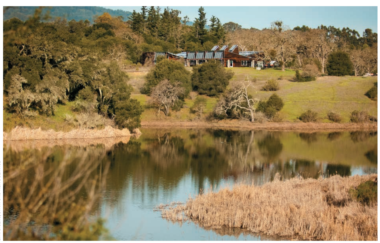
The university's Jasper Ridge Biological Preserve supports an average of 60 research projects each year.

Keeping the land intact has allowed the university to retain one of the country's most magnificent campuses, which is a strong magnet for potential students, faculty, and researchers. Even the undeveloped land serves important academic purposes. For instance, the Jasper Ridge Biological Preserve covers 1,189 acres of the campus and has been the site of many fundamental studies in ecology, hydrology, geology, and archaeology.