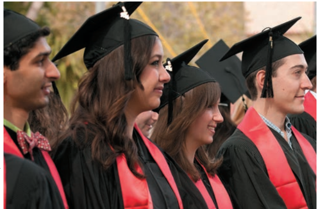
Tuition covers only about two-thirds of the real costs of a Stanford undergraduate education.

What's more, tuition covers only about two-thirds of the real costs associated with a Stanford undergraduate education. Thus, even those paying "full price" are not actually paying the full cost of four years at Stanford. From the university's first days, a Stanford education has been subsidized by the generosity of the founders, alumni, parents, friends, and other donors. Today, nearly half of all Stanford undergraduates receive need-based aid directly from the university.