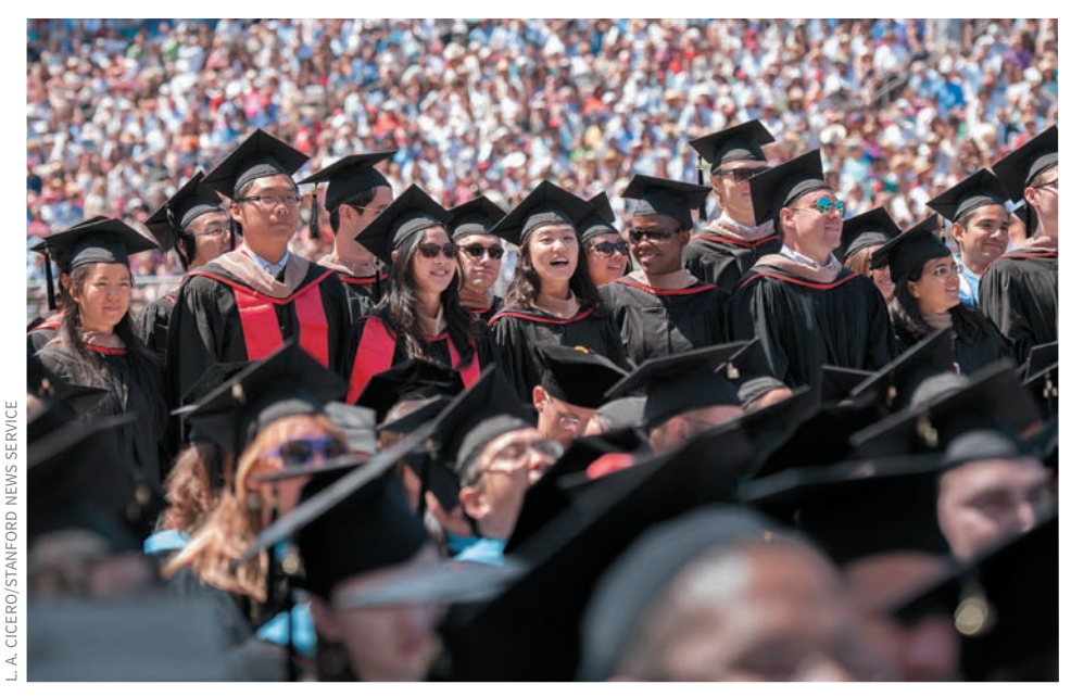
Stanford confers approximately 1,700 undergraduate and 3,300 graduate degrees each year.

endowment was $21.4 billion, an increase of 14.8 percent over the previous year. (The increase reflects the impact of investment returns plus new endowment gifts and transfers, minus the payout to support university operations.)