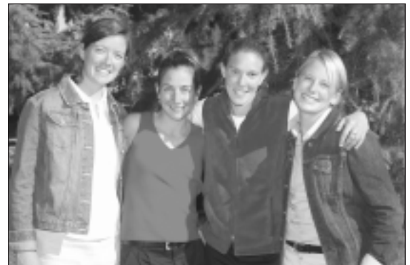
Stanford's Coaching staff