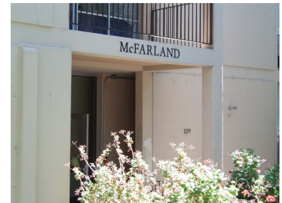
McFarland midrise will be fully sprinklered by the end of summer 2013

Stanford has made a commitment to install automatic fire sprinkler systems in graduate housing facilities. Two highrise and four midrise buildings are not fully sprinklered. Stanford plans to complete the sprinkler installation in these facilities in the future. One midrise (Abrams) was sprinklered in 2011. Currently, another midrise (McFarland) is being sprinklered.