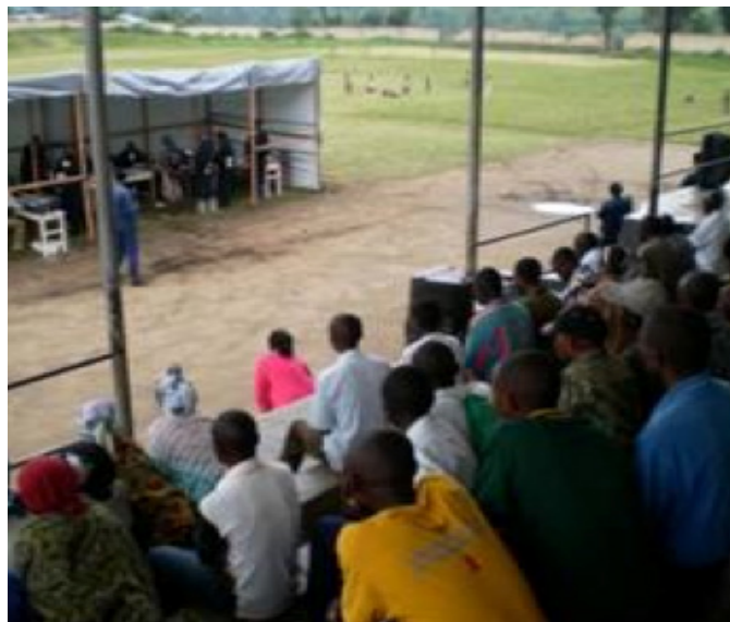
Community members observe a military mobile court session as part of an INL-funded project in Rutshuru, Democratic Republic of Congo.

of their laws for compliance with obligations under CEDAW, other international instruments, the partner country's constitution, and national action plans related to gender and women's rights. Activities could include providing model laws and otherwise supporting the criminalization of all forms of sexual and gender-based violence and offering remedies for discrimination and sexual and gender-based violence, including reparations and compensation programs.