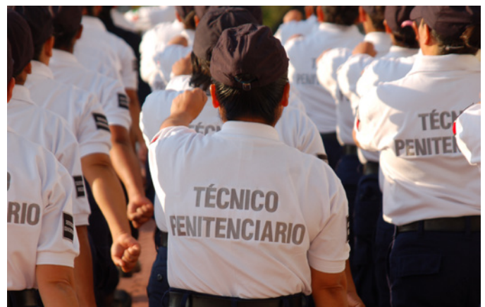
INL helped Mexico open its federal penitentiary academy in Xalapa, Veracruz in May 2009. Since that time 453 academy instructors — both male and female — have been trained in the USA and 210 instructors trained in Xalapa. These instructors have gone on to train almost 7,000 new penitentiary agents, more than 50 percent of whom have been women.

Training. One way to promote equality of women is to encourage partner country counterparts to consider gender balance among participants in training sessions—including technical training as well as training in leadership, problem solving, and strategic planning. As with task forces and similar bodies, in some cases the ideal gender balance for training might be equal and