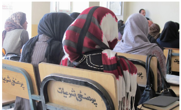
Female law students participate in the INL-funded Young Lawyers-in-Training Program, implemented in partnership with Global Rights, at the Kabul University Sharia faculty.

Political will. Are criminal justice institutions and actors (especially at the senior levels) engaged and willing to integrate women more proportionately into criminal justice institutions, and if so, to what extent and how? Are there any policies or practices in place in the partner country that would prevent the integration of gender components in INL assistance activities? Has there been dialogue and consultation with criminal justice institutions and actors to assess the will and capacities for integrating gender into policies and practices, and for protecting women from sexual and