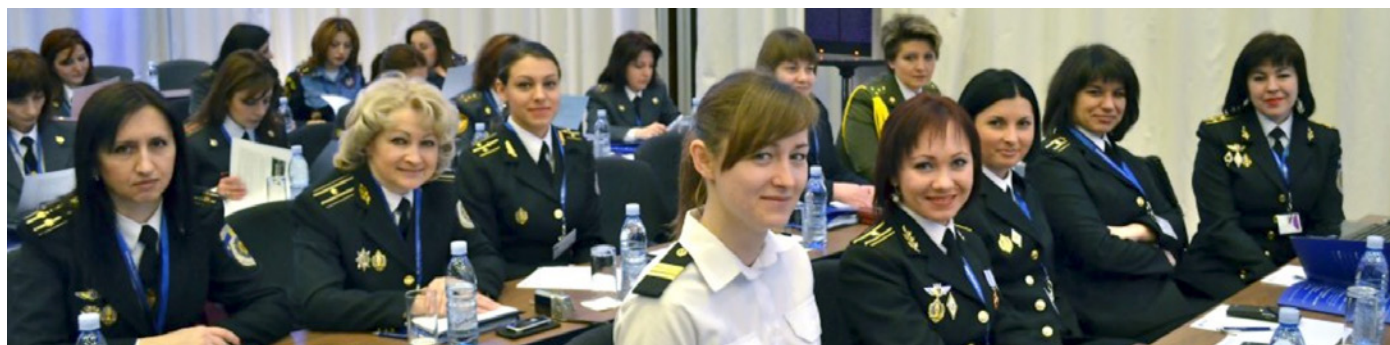
Police officers from Moldova joined colleagues from Georgia, Ukraine, Armenia, and Azerbaijan at a U.S. government-sponsored “Women in Policing” conference in Tbilisi, Georgia, to sharpen their leadership and practical police skills.