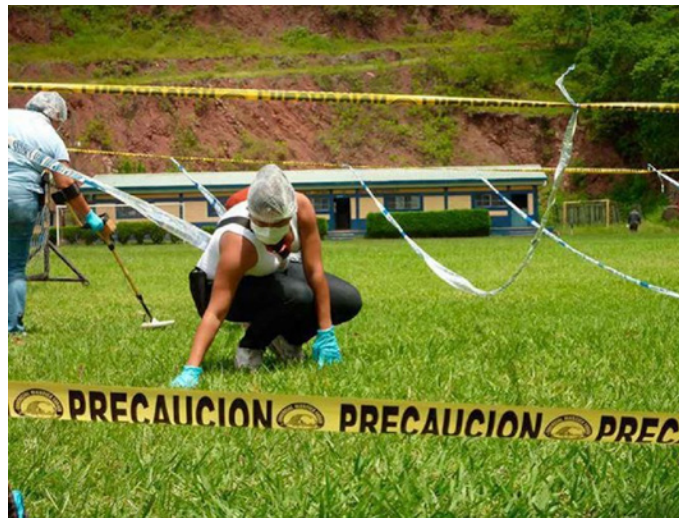
Using mock crime scenes, Embassy Tegucigalpa trained Honduran police in preserving crime scene evidence.

Training. Training for police, public defenders, prosecutors, court personnel, judges, and corrections professionals should include a focus on sensitivity to gender issues, international human rights law, women’s rights, avoiding gender bias, and preserving the dignity of female witnesses and survivors during investigations and trials. Activities could focus on developing