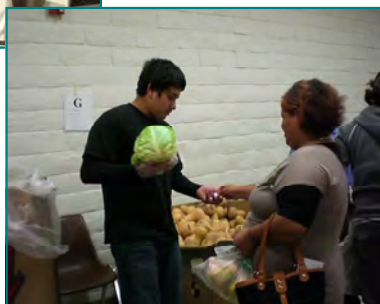
(Right) Family Harvest Monthly Food Distribution

"Your Human Services Specialist did a wonderful job explaining what could be provided for my family...We are extremely thankful." - Comments from 2011 Customer Satisfaction Survey