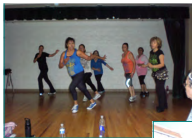
(Above) Zumba class