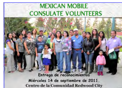
(Above) Mexican Mobile Consulate Volunteer Appreciation Event