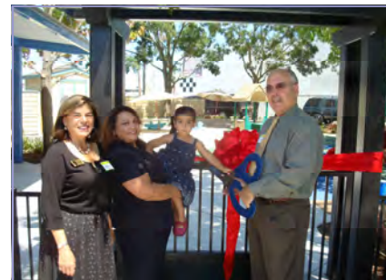
(Above) Ribbon Cutting of the new Redwood City Child Development Program Toddler Playground