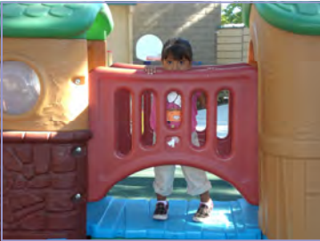
(Below and Right) Playing in the new toddler playground.