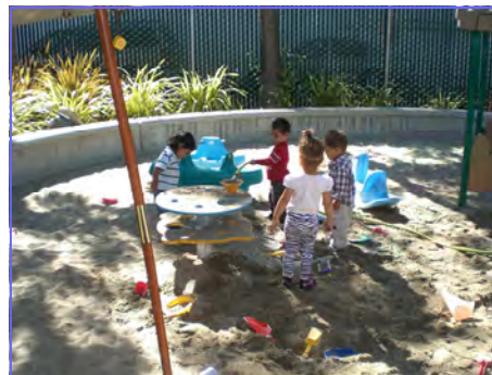
(Left) Adult Activity Center Holiday Party