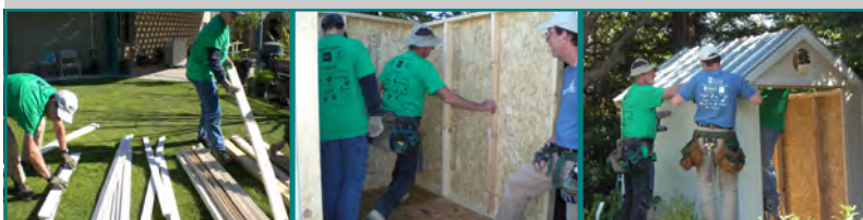
Rebuilding Together volunteers construct new garden shed