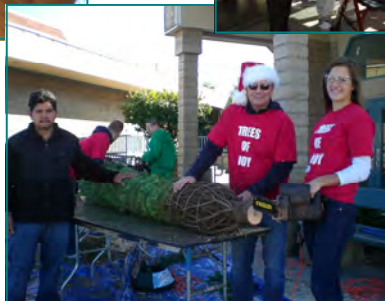
(Above) Trees of Joy giveaway