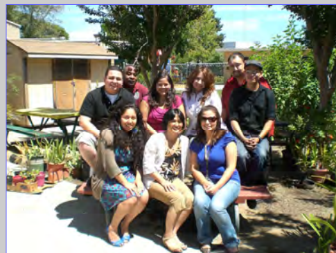
Fair Oaks Community Center Staff