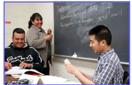
International Institute of the Bay Area's Citizenship Class

-E-mail from community partner to our Benefits Navigator