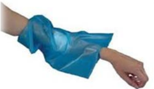
Central Venous Internal Line: Port