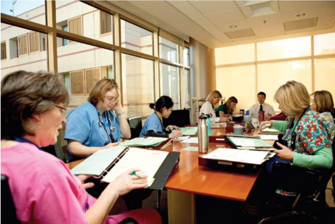
Staff nurses, advanced practice nurses, PAs, MDs, dietitians, social workers, and pharmacists all participate in Infusion Treatment Area's (ITA) morning rounds to discuss the plan of care for the BMT patients.

(By contrast, healthy patients have a white cell count between 4,000 and 11,000.) During this time infection is our biggest enemy. Once patients' white blood cell counts drop, they are placed in private positive pressure rooms to reduce the risk of infection.