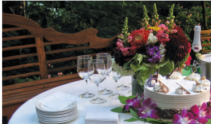
The Patient and Family Emergency Fund helped a couple celebrate a special occasion while in the hospital.