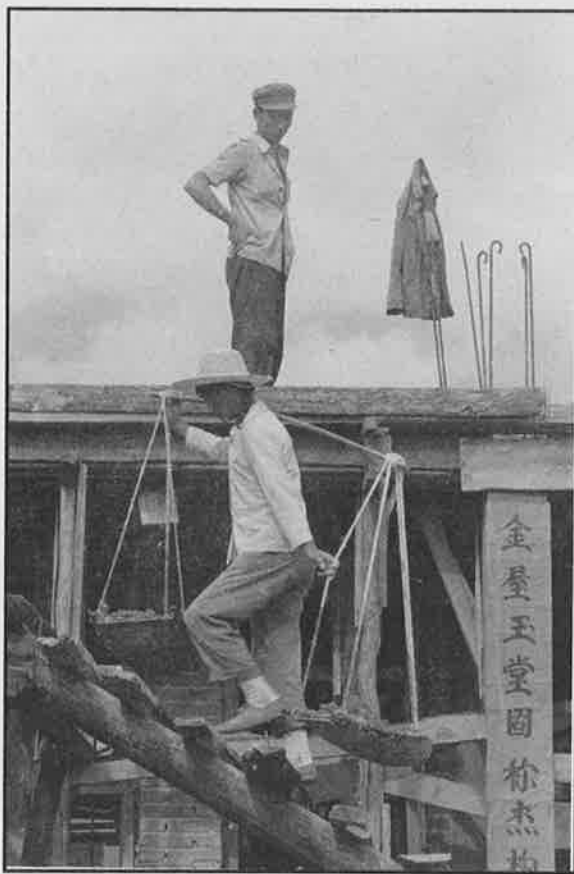
House building in Dali, Yunnan Province

pulled noodles, I talked with my newly made friends about everything from American holidays to World Cup soccer.