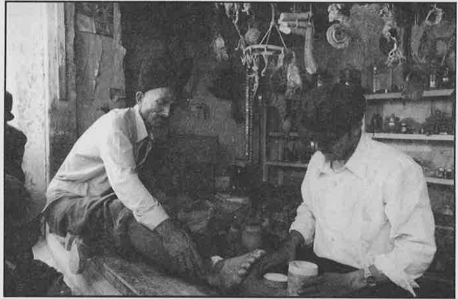
Uighur doctor treating a leg wound, Yingasar, Xinjiang