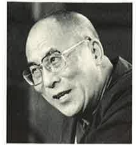
HIS HOLINESS THE DALAI LAMA