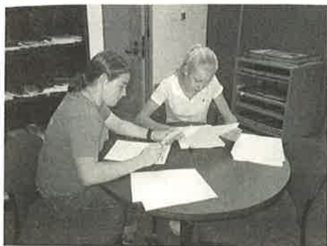
PALO ALTO HIGH SCHOOL STUDENTS EXAMINING SPICE RESOURCES.

Since 1976, the Stanford Program on International and Cross-Cultural Education (SPICE) has served as a bridge between Stanford and K-12 schools. SPICE draws upon the diverse faculty and programmatic interests of the Center for East Asian Studies to create curriculum materials on Asia and U.S.-Asian relations.