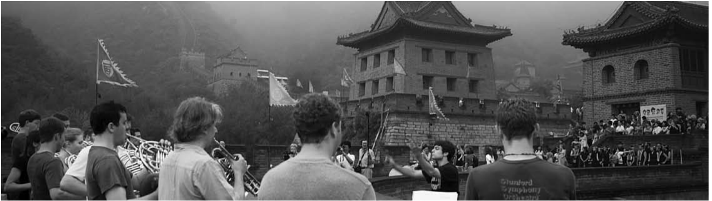
Stanford Music Department Ensemble playing on the Great Wall.

Confucius said: “When a friend comes from afar, is not this joyful!” Confucius could not have been more correct. Just one month before the beginning of the 2008 Beijing Olympics, Stanford music ensembles descended upon China.