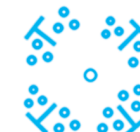
"In the Round"