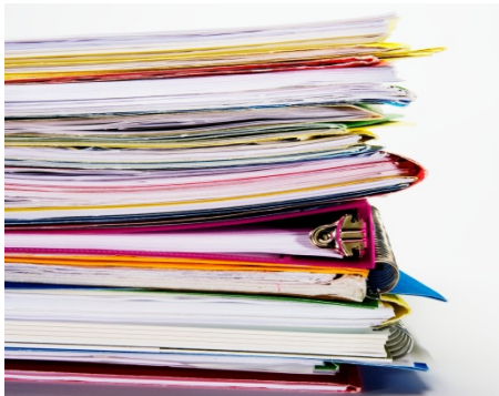
Chart / retrospective records review