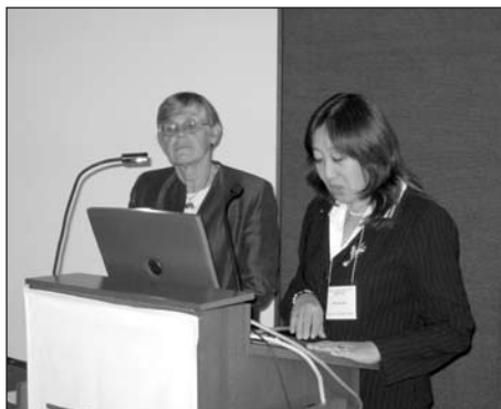
Portuguese for Spanish Speakers Symposium