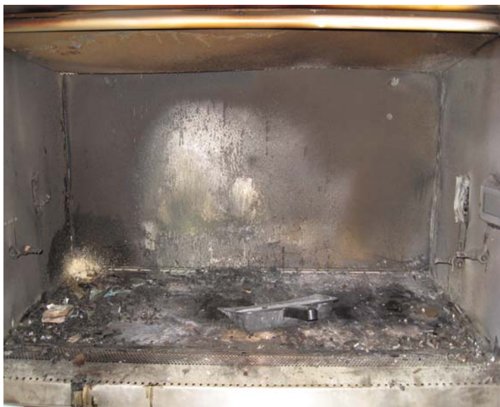
Figure 3. Don't let this be your cabinet! Fire damage resulting from the use of an open flame and alcohol inside a BSC.