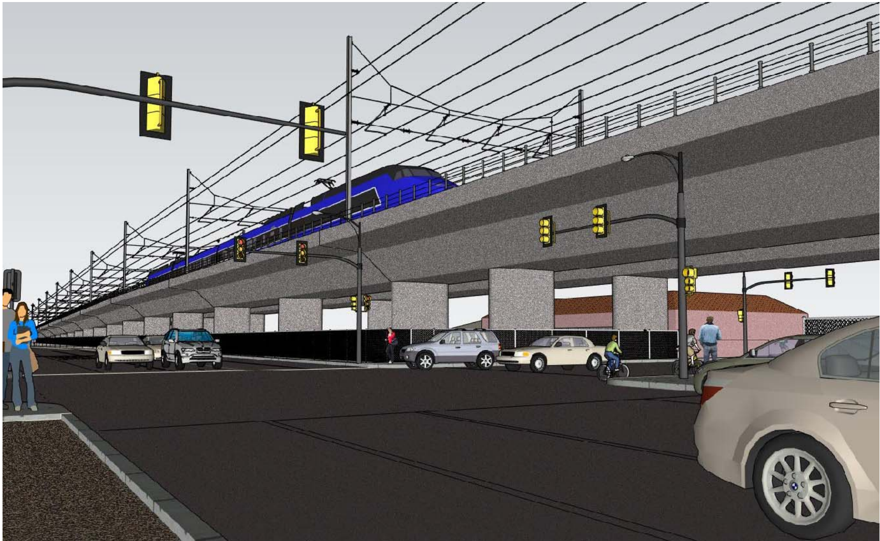
HIGH SPEED RAIL - AERIAL VIADUCT CONCEPTUAL SKETCH MAY 2010