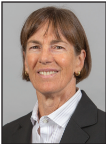
TARA VANDERVEER HEAD COACH 30TH YEAR