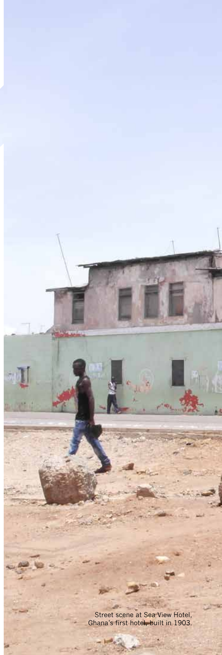
Street scene at Sea View Hotel, Ghana's first hotel, built in 1903.