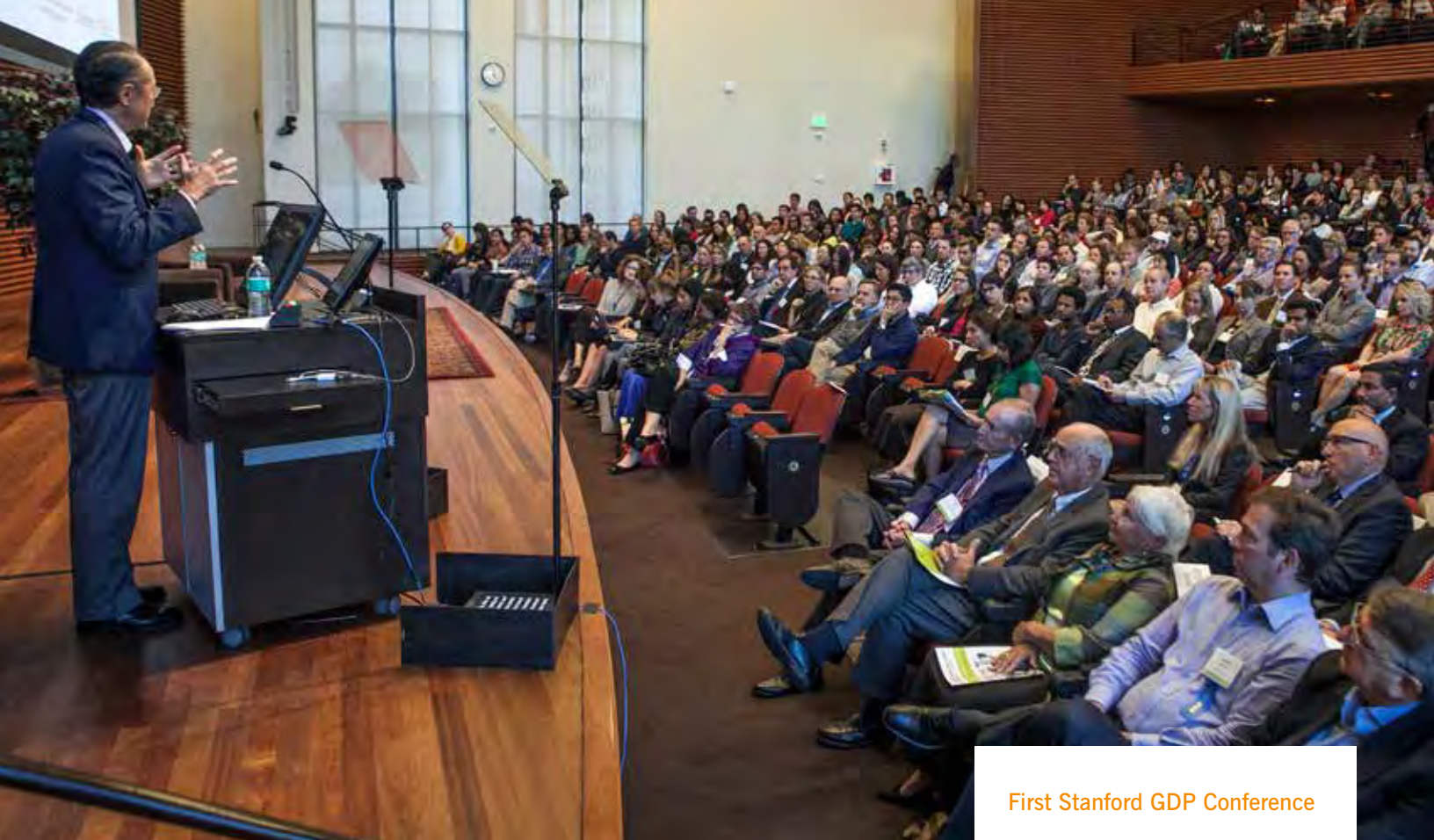
First Stanford GDP Conference

In October, the Stanford Global Development and Poverty Initiative (GDP) convened top scholars, policy experts, and leaders from the private sector and nonprofit organizations to discuss and debate how technology, private enterprise, and institutional reform can work together to promote economic prosperity and improved health for all people living in developing countries. Jim Yong Kim, President of the World Bank Group, delivered the keynote address.