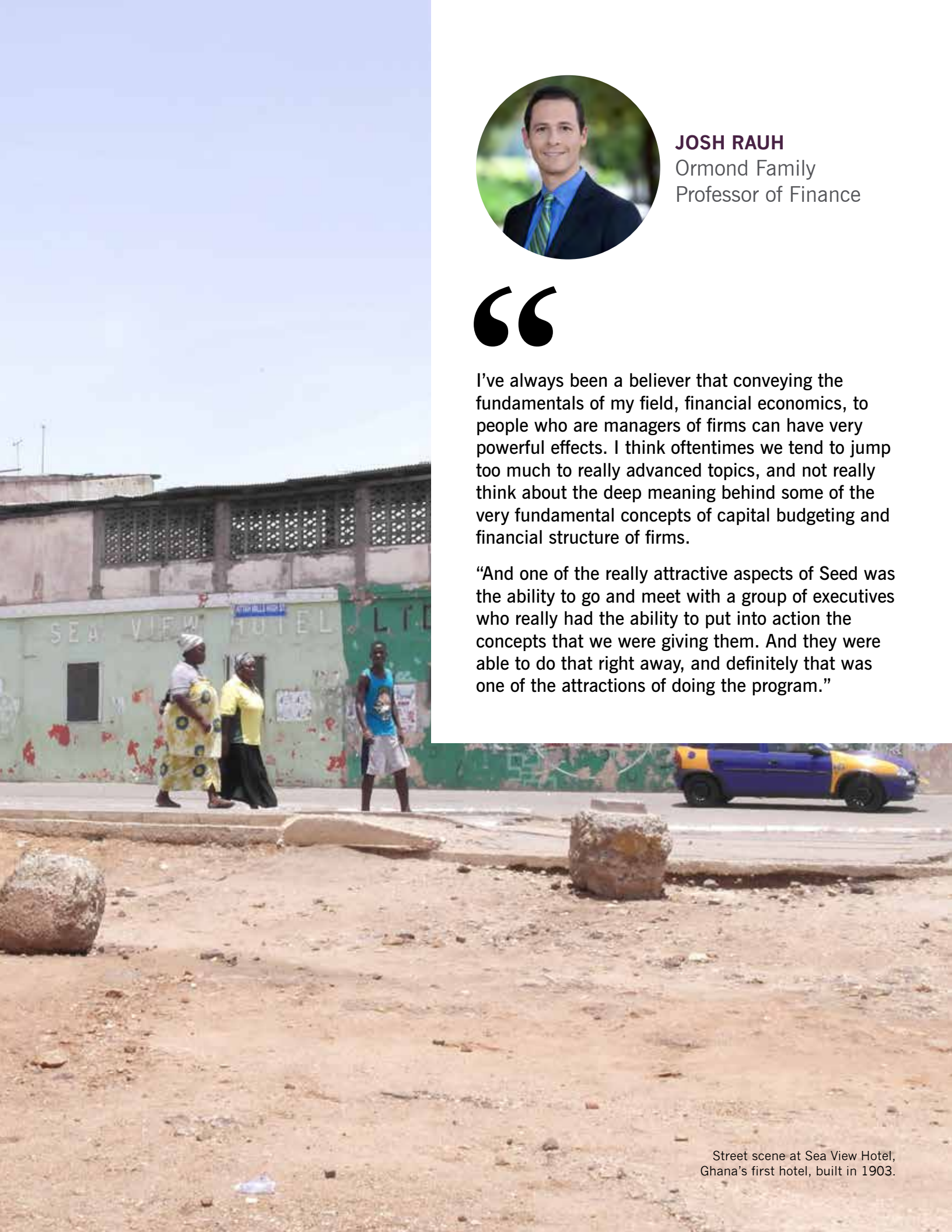
Street scene at Sea View Hotel, Ghana's first hotel, built in 1903.

“And one of the really attractive aspects of Seed was the ability to go and meet with a group of executives who really had the ability to put into action the concepts that we were giving them. And they were able to do that right away, and definitely that was one of the attractions of doing the program.”