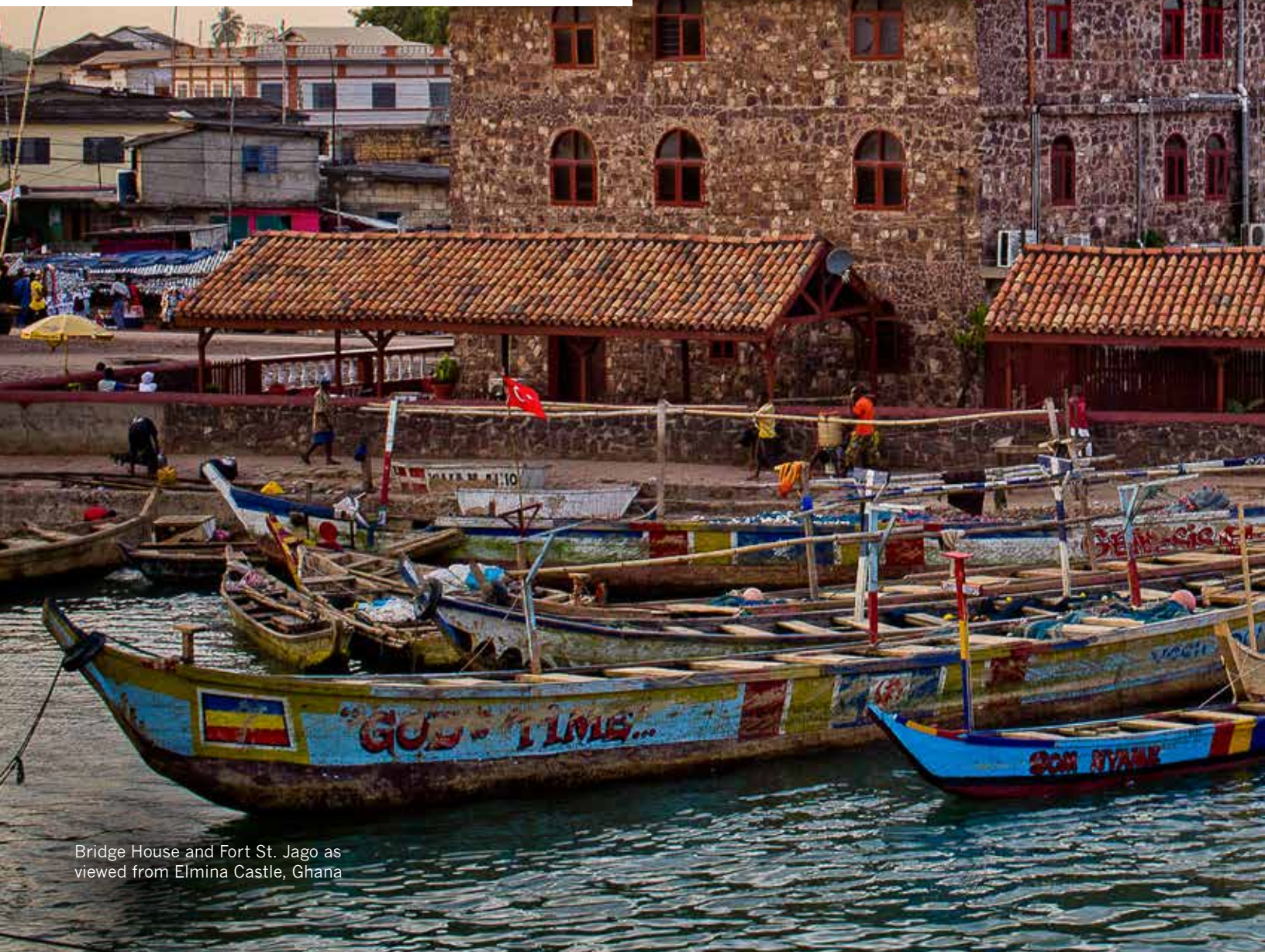
Bridge House and Fort St. Jago as viewed from Elmina Castle, Ghana