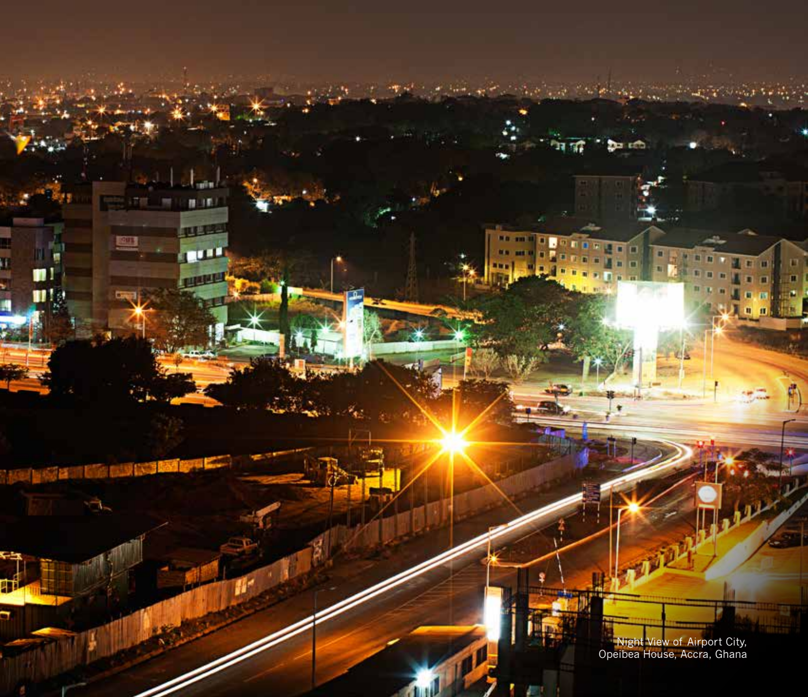
Night View of Airport City, Opeibea House, Accra, Ghana