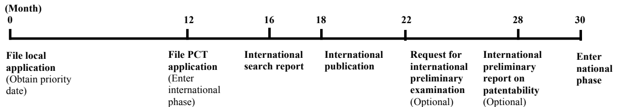
Figure 6 Timeline for typical approach for filing a PCT application 31

Since Singapore is a contracting state under PCT, Singapore residents or nationals may file the PCT application in Singapore with the Registry of Patents at IPOS, which acts as a PCT receiving office. Alternatively, they can file PCT applications with the International Bureau of WIPO.