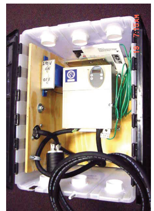
VFD mounted in box

4. Other Options - For added flexibility, consider a variable frequency drive (VFD). The VFD is easy to operate, can convert single-phase power from small generators to three-phase power, and can supply power under a variety of horsepower demands. Small, portable generators that can be used with a VFD are readily available from the nearest hardware supplier. Consult your licensed electrician to see if a VFD is right for your utility.