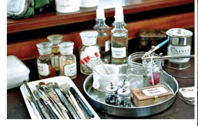
Airbrush equipment is used to retouch paints. Right: Gundula Tutt injects a special formula to consolidate the chipping original nitro paint layers on a Voisin C 11.