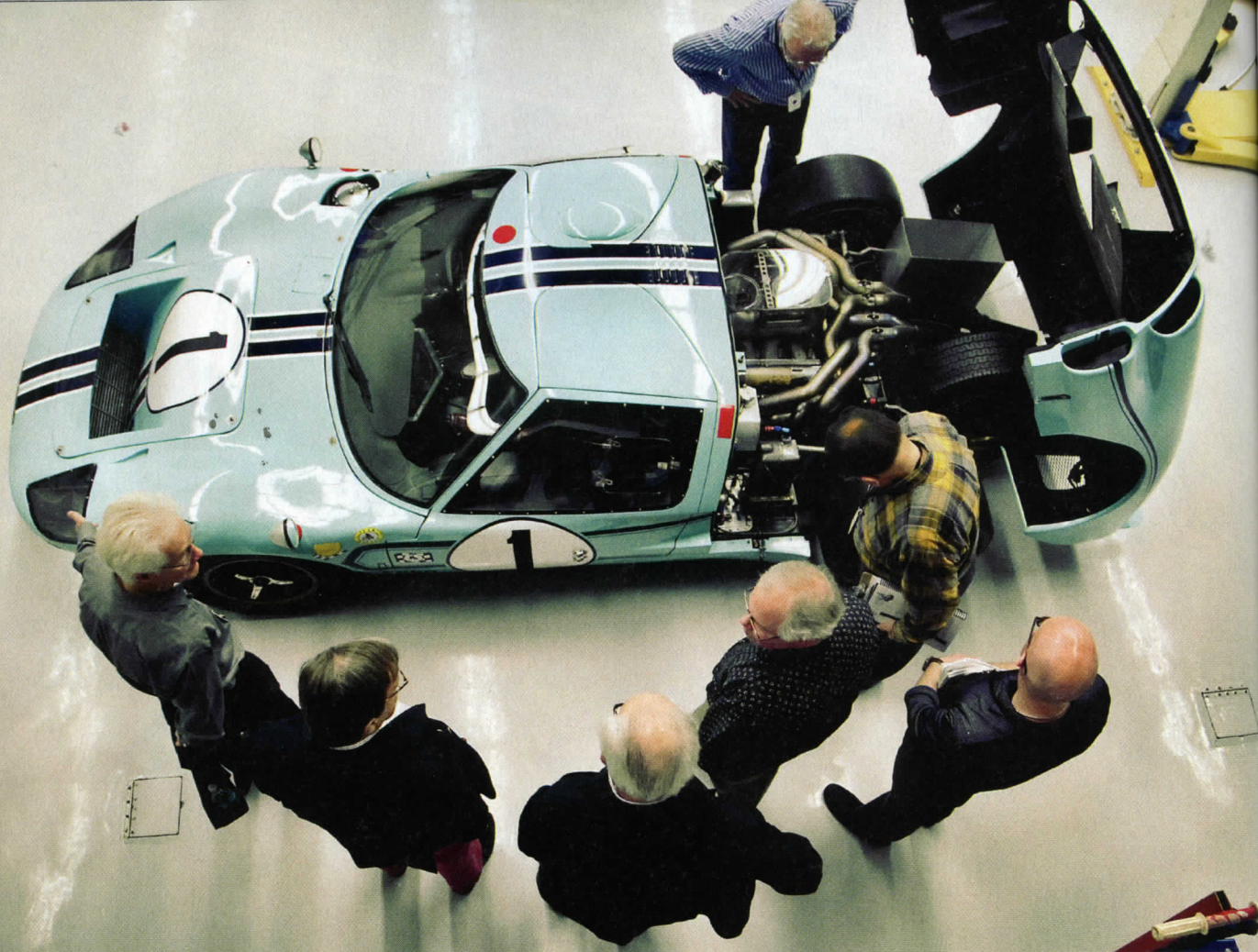
Attendees gather around an ex-Briggs Cunningham Ferrari 166 (previous page) and the Ford GT40 Mark II B (above) that Dan Gurney pushed across the finish line at Sebring in 1966. Nick Mason (right) holds court in front of a Porsche 917K.