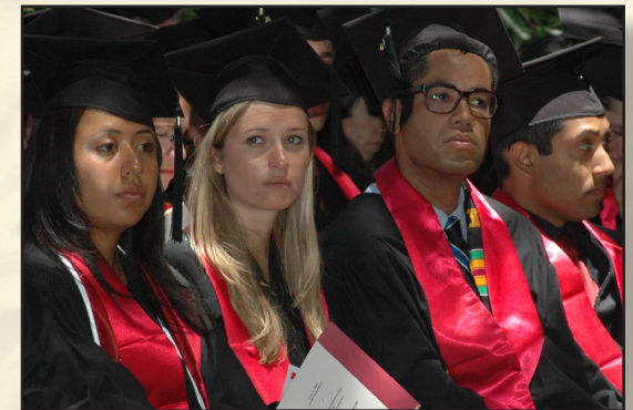
IR students at Stanford Commencement

ICA is answering our students' need to better understand the complexity of international problems and develop solutions. International customs, culture and processes are becoming more important in both work and personal lives and all of our Centers and programs are seeing increased interest from the student population and within the community. The International Relations program in particular is experiencing higher enrollment each year. Global trade, development and communication are all seen as interrelated and interdependent and approximately 120 undergraduate students have declared IR as their major in 2010-11. In addition to coursework, an IR Summer Research Program is offered that has been very successful, enabling students to pair with faculty members and work on specific research projects. Last summer, fifteen students participated with the faculty and students presenting to the group on topics such as Mapping Terrorist Organizations, Assessing Foreign Aid, and The Political Economy of Energy Efficiency.