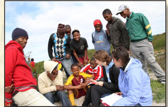
Research in Khayelitsha, Cape Town