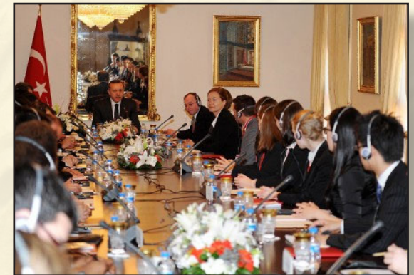
IPS students meet with Prime Minister Erdogan in Turkey