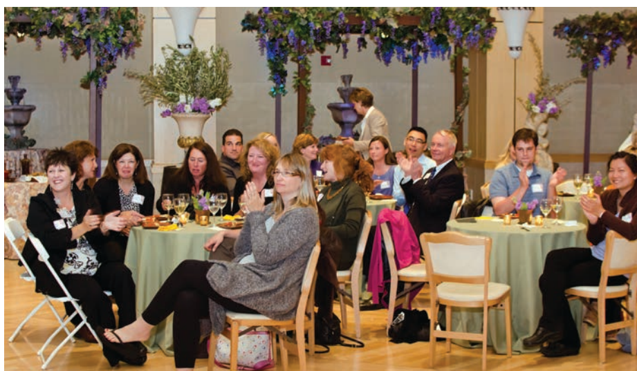
Magnet redesignation celebration

The Magnet Recognition Program, ANCC Magnet Recognition, Magnet names and logos are registered trademarks of the American Nurses Credentialing Center. Journey to Magnet Excellence and National Magnet Conference are trademarks of the American Nurses Credentialing Center. All rights reserved.