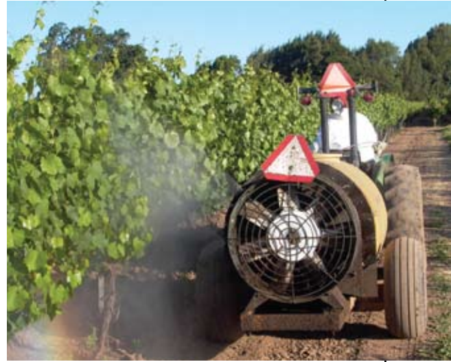
Although some pesticide may move off target in any application, applicators can and must prevent harmful drift.

Because pesticides can drift, applicators are legally required to take all possible measures to make sure that any off-site