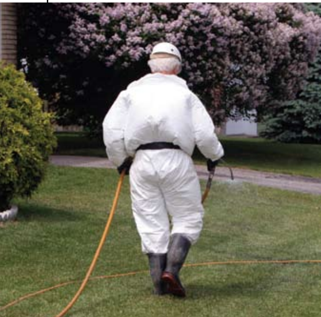
Drift can occur from residential and household pesticide applications, too. It can even happen indoors.

Because some drift can occur with any application (and may be in amounts too small to affect people or property), the laws focus on preventing substantial drift.