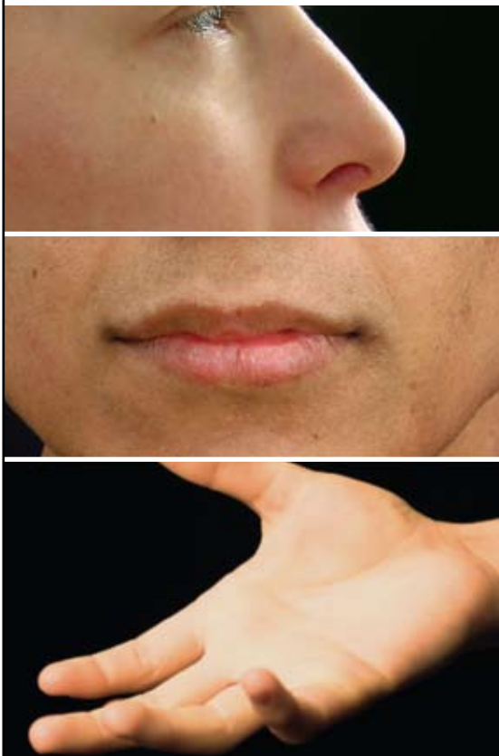
Humans can be exposed to pesticides by breathing it, getting it into their mouth, or absorbing it through the skin.

can cause great harm, but almost any substance can cause harm in large enough doses. That's why, when we consider risk, we consider both the toxicity and your exposure to it (how, how much, how long).