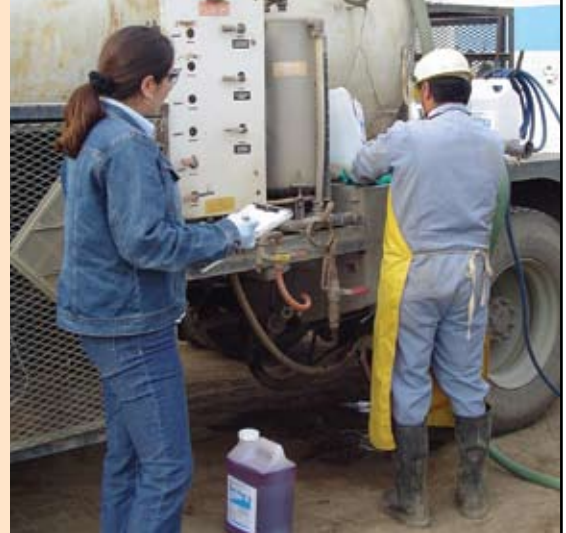
To investigate complaints, staff from the County Agricultural Commissioner's office will gather evidence to find out if pesticide laws were broken.

After the Agricultural Commissioner's staff complete their investigation, they prepare a report describing what occurred. If they found violations, they can also assess fines and other penalties. Agricultural Commissioners send their reports to DPR where scientists look for illness trends and potential problem areas. Scientists at DPR and the U.S. Environmental Protection Agency also rely on the information to improve use practices and safety information on pesticide labels.