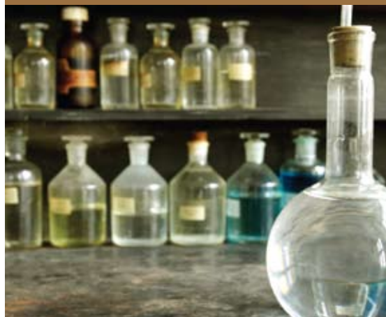
Pesticides typically contain several ingredients, any one of which may produce a sickening odor.

A breakdown product is the result of a chemical breaking apart into other chemicals. Some kinds of pesticides break down when exposed to sun or rain, or to bacteria found in soil. The breakdown is a natural process that may produce a compound that is more or less toxic than the original chemical. Many common pesticide breakdown products contain sulfur, which has a particularly bad smell.