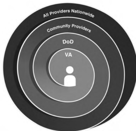
Figure 1. VA Definition of EHR Interoperability

“Level 2 Interoperability,” as described in the Panel discussion, addresses the ability for VA to leverage the same Cerner platform used by DoD to ensure seamless care from active service to Veteran status. Once this capability is implemented, the clinical data transformation will allow a true longitudinal view of a Veteran’s record as he or she transitions from DoD to VA for care and other critical services such as benefit adjudication.