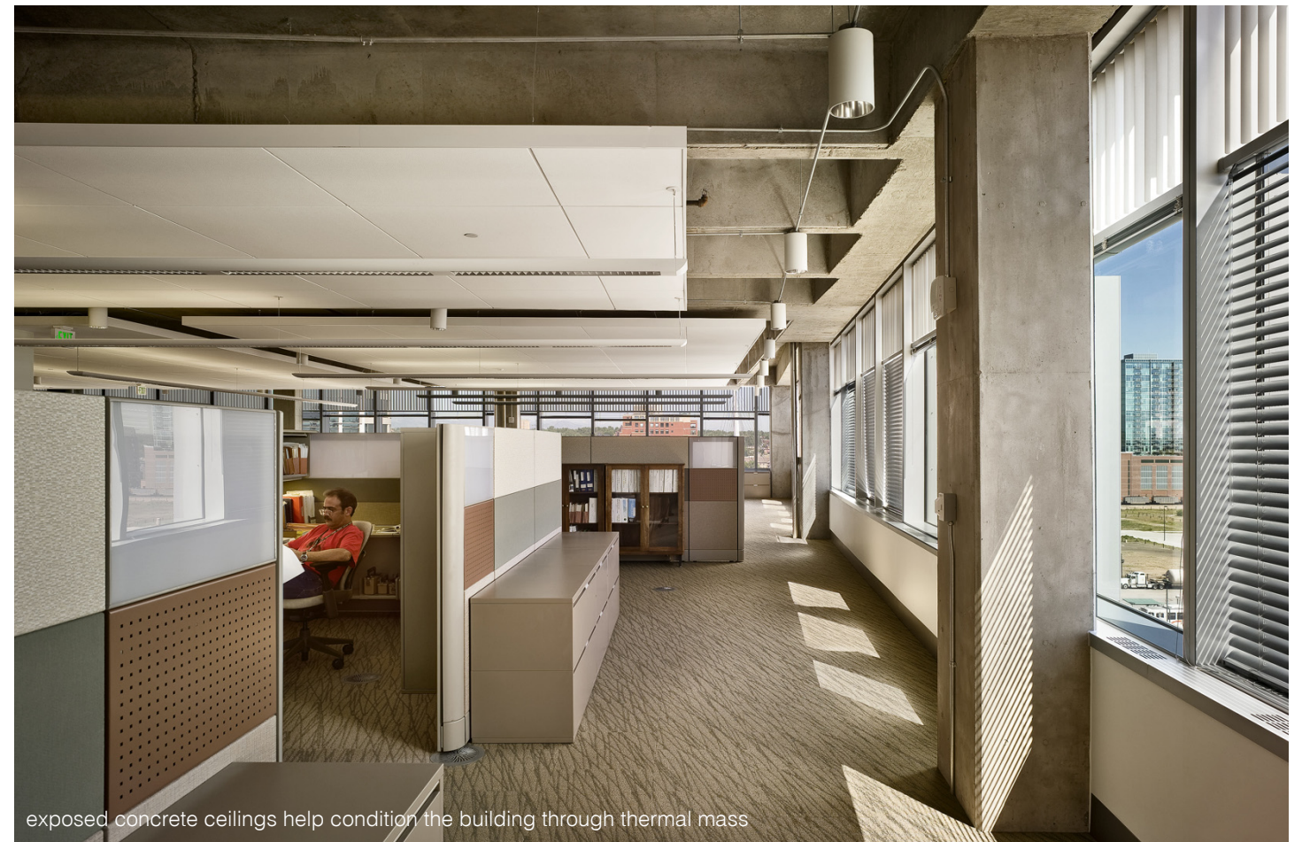
exposed concrete ceilings help condition the building through thermal mass