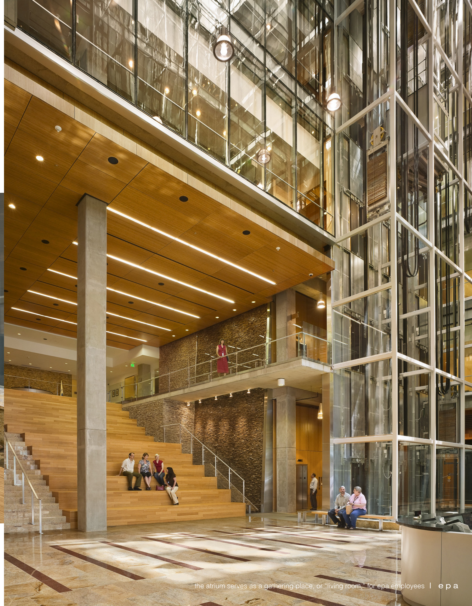
the atrium serves as a gathering place, or "living room," for epa employees | epa