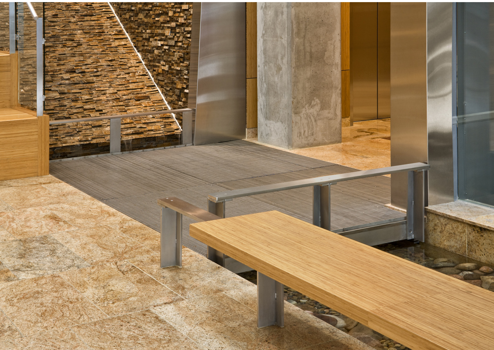
reminiscent of a colorado stream, water cascades over tiles and river rock in the building's atrium adding a visual, acoustical and thermal effect to the space