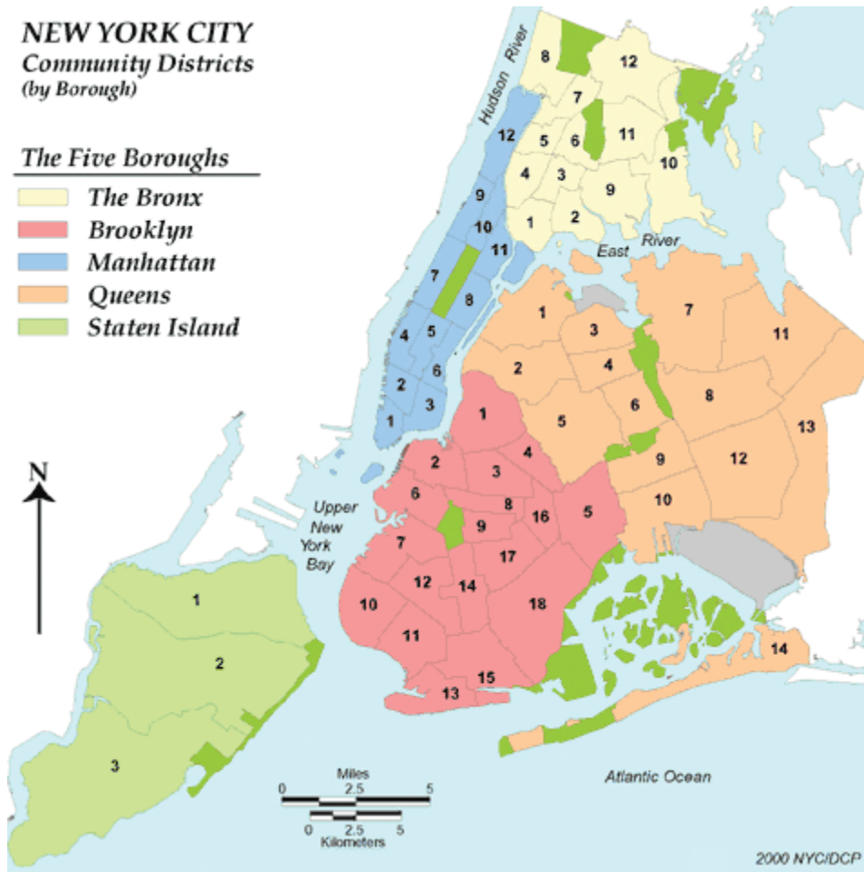
Figure 1: New York City Community Districts (NYC Department of City Planning)