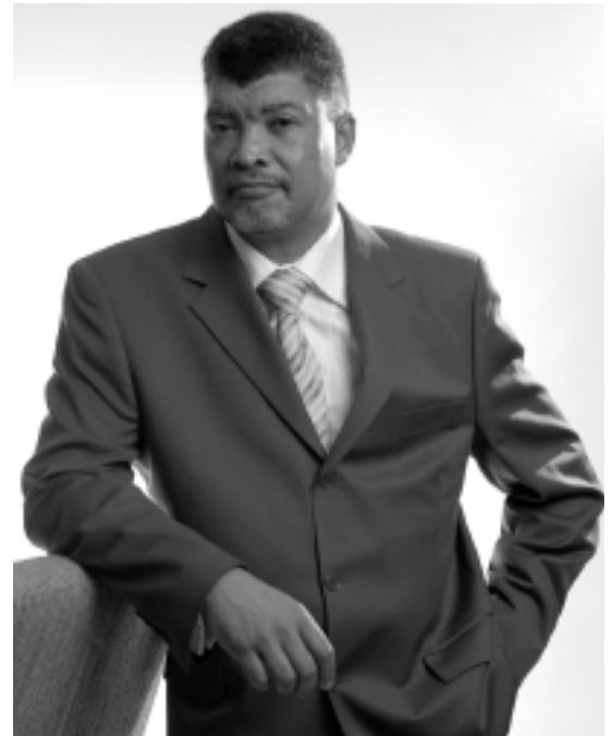
PHOTO: Ihron Rensburg has spearheaded the development and transformation of the education system in post-apartheid South Africa. He was recently elected vice chancellor of the new University of Johannesburg.