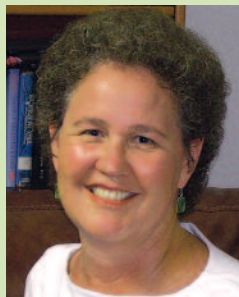
Professor Linda Darling-Hammond has played a lead role in developing Barack Obama's ambitious plans for improving U.S. schools.

reform, teaching quality, and educational equity at the federal, state, and local levels. At Stanford, she has founded and oversees the School Redesign Network, which works across the nation to transform schools to teach 21st century skills and to support school success through innovations in school organization, curriculum, and assessment.