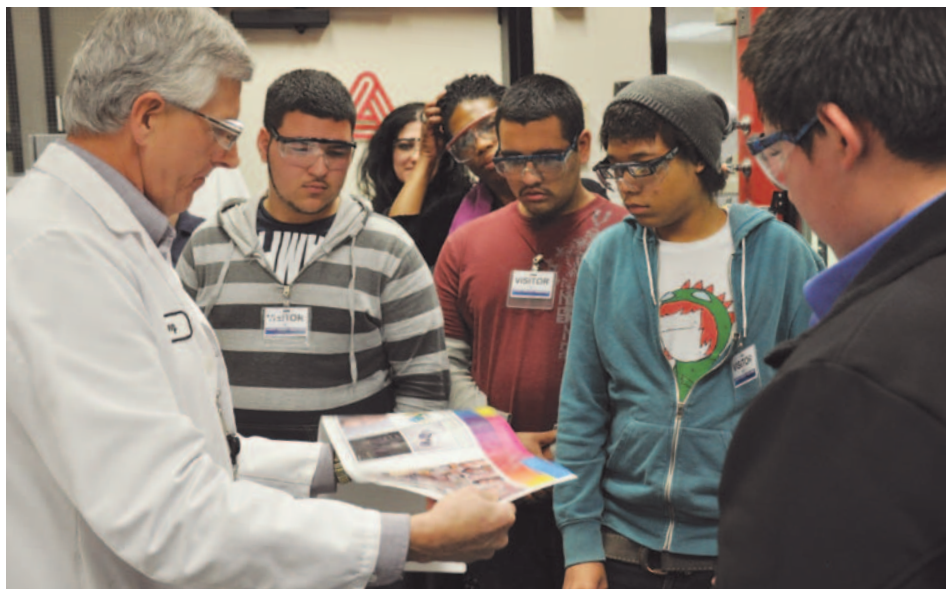
Students from John Muir High School meet with a scientist at the Avery Research Center in Pasadena, looking at samples of products developed at the lab.

Linked Learning stresses continuous integration of academic instruction with demanding technical curriculum, field-based learning, and student supports, embedded into career-themed schools or smaller learning communities known as “pathways.” With Linked Learning,