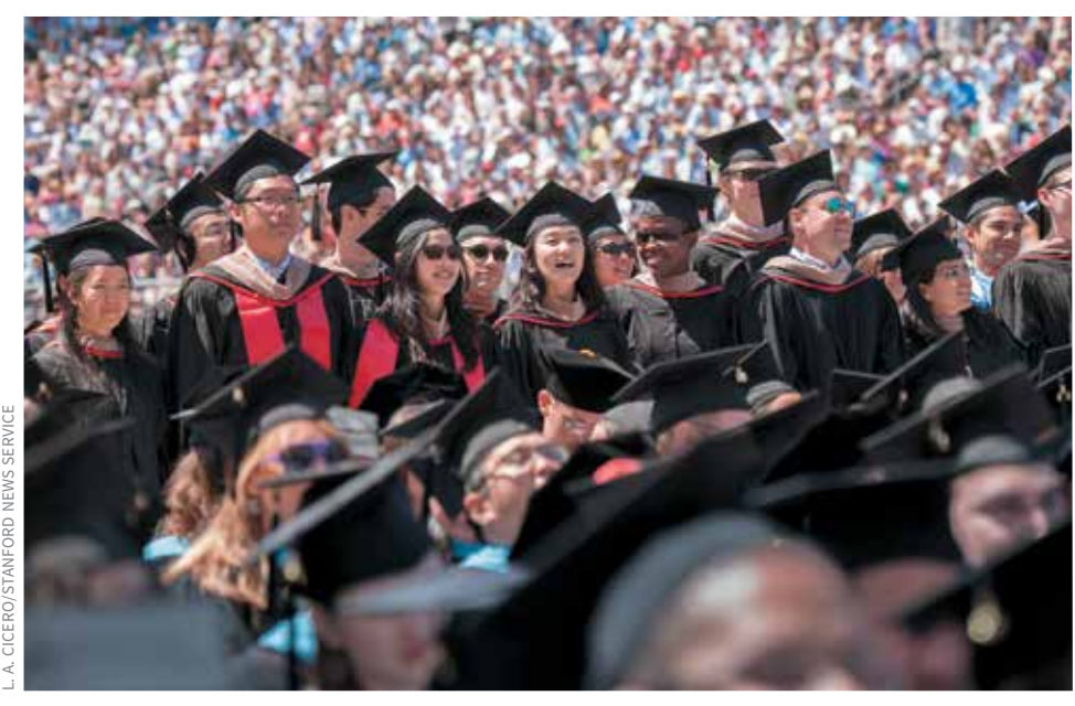
Stanford confers approximately 1,700 undergraduate and 3,300 graduate degrees each year.

endowment was $22.2 billion, an increase of 3.6 percent over the previous year. (The increase reflects the impact of investment returns plus new endowment gifts and transfers, minus the payout to support university operations.)