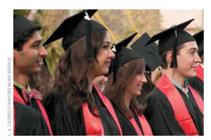
Tuition covers only about two-thirds of the real costs of a Stanford undergraduate education.

year. What's more, tuition covers only about two-thirds of the real costs associated with a Stanford undergraduate education. Thus, even those paying "full price" are not actually paying the full cost of four years at Stanford. From the university's first days, a Stanford education has been subsidized by the generosity of the founders, alumni, parents, friends, and other donors. Today, nearly half of all Stanford undergraduates receive need-based aid directly from the university.