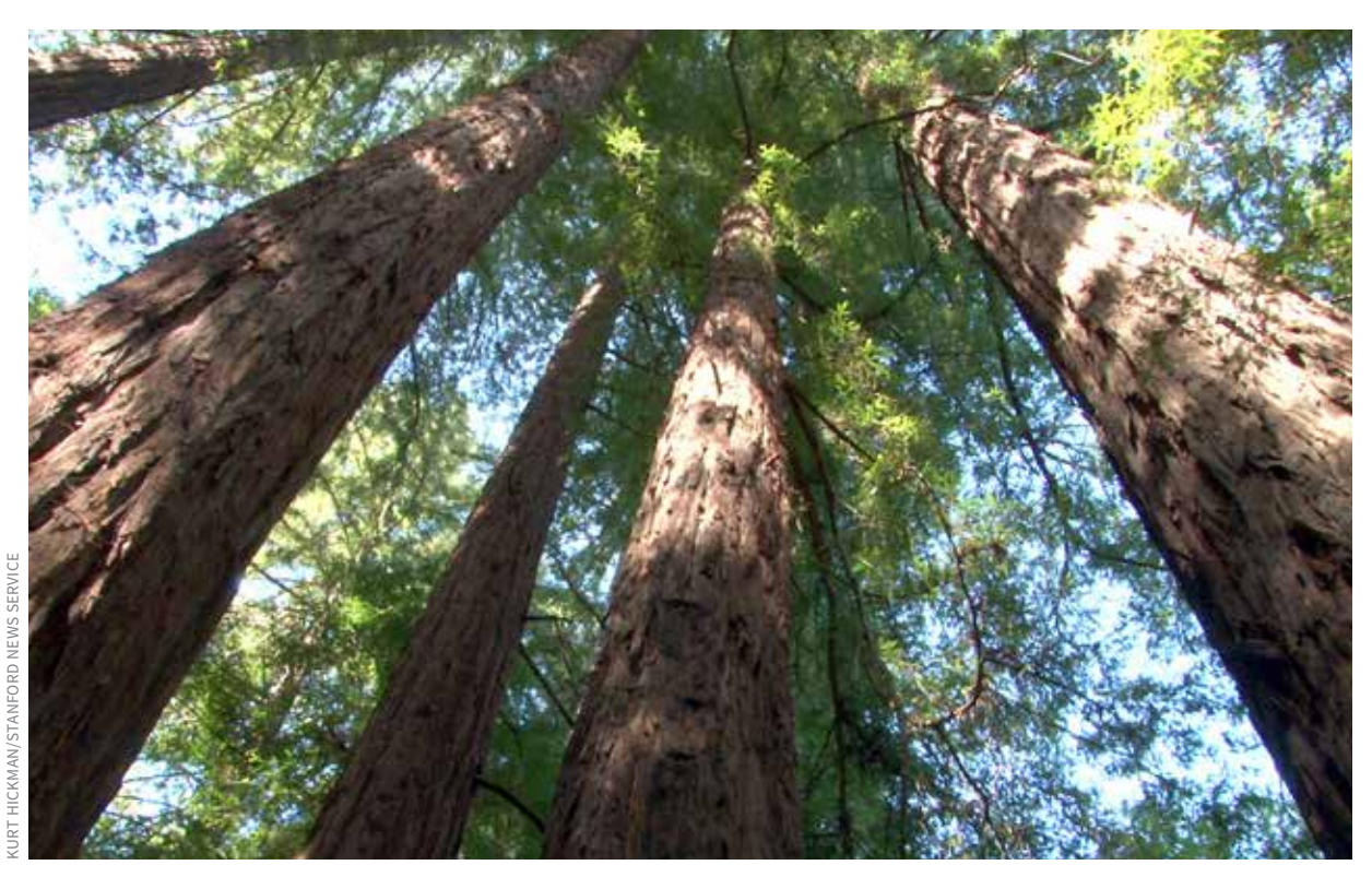
The university's Jasper Ridge Biological Preserve supports an average of 60 research projects each year.

Keeping the land intact has allowed the university to retain one of the country's most magnificent campuses, which is a strong magnet for potential students, faculty, and researchers. Even the undeveloped land serves important academic purposes. For instance, the Jasper Ridge Biological Preserve covers 1,189 acres of the campus and has been the site of many fundamental studies in ecology, hydrology, geology, and archaeology.