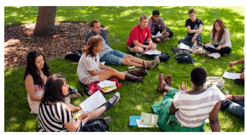
Stanford enrolls about 7,000 undergraduate students.

Most gifts made to the university are under $1,000. Together, these gifts add up to millions of dollars that can be used for need-based financial aid, academic programs, solutions-oriented research into global problems, and programs such as the Haas Center for Public Service.