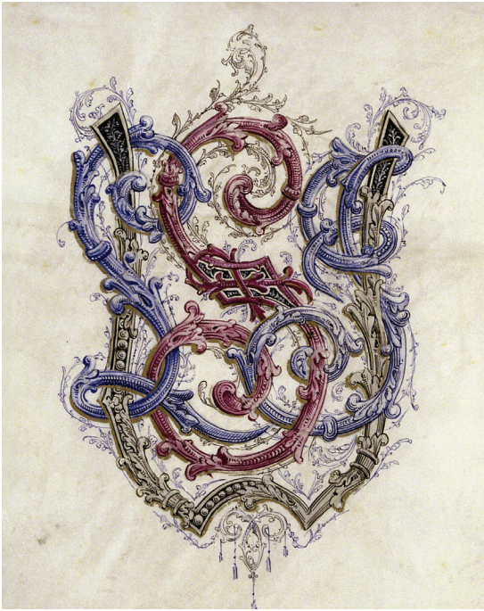
The crest of the Founding Grant Society

“...each individual act of support reaffirms the Stanfords’ promise to children of the future ... that it will be better, that they are needed to make it better, and that a legacy of education will serve them more than any other.”