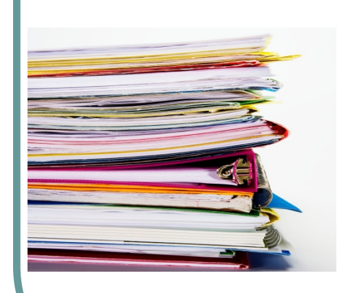
Chart / retrospective records review

Researcher provides no information and does not obtain authorization from the participants.