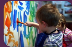
On-Site Child Care & Parenting Resources