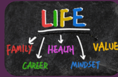
Education and Resources