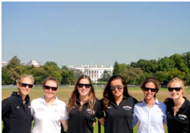
Navy Women's Team touring Washington DC

handed college sailing with both excitement and nervousness. Prior to Stanford, I solely focused on laser radial sailing so college was a transition for me complete with much shorter racecourses, new boats, and a new role. I started this fall season sailing as a crew, which allowed me to get used to the new boat and learn the different jobs in a double-handed boat.