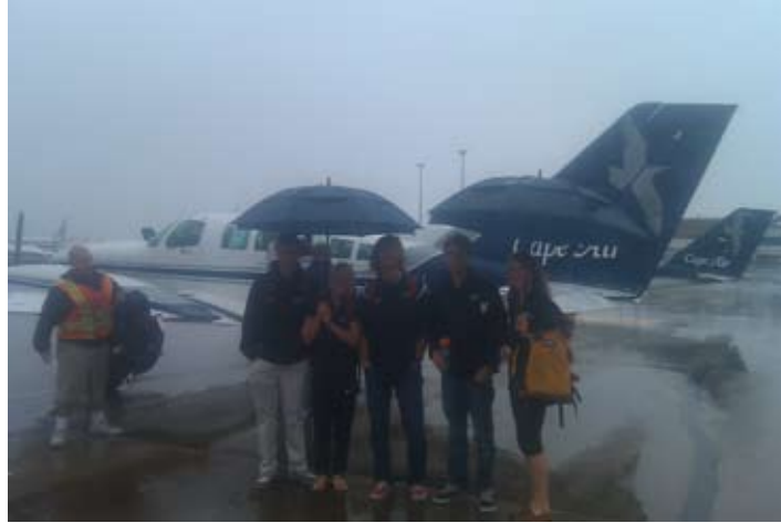
Captain Hurst Team on the runway in Boston before a turbulent flight to West Lebanon, NH

When I first saw my name on the board for the Captain Hurst Bowl at Dartmouth, I knew I was in for a wild ride. I had heard many stories from the previous Captain Hurst Team that the conditions were crazy and somewhat unexplainable in words,