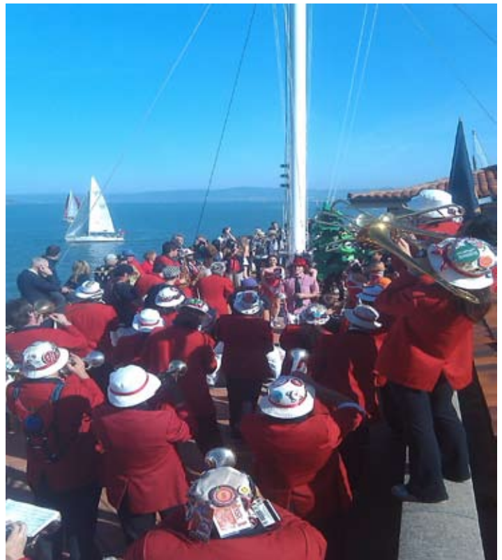
Battle of the Bands on the Race Deck at St. Francis Yacht Club during the 2011 Big Sail