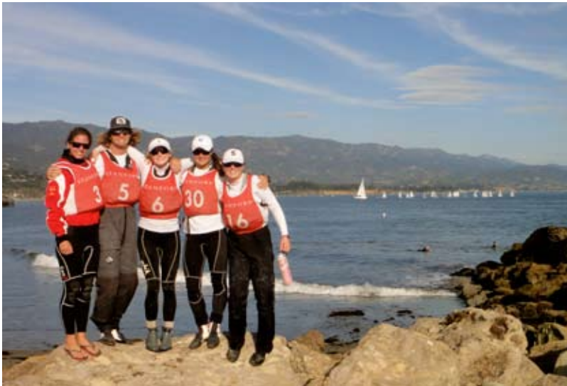
The Cardinal at Fall PCCs in Beautiful Santa Barbara.

In the end we ended up with the win and walked away feeling confident in our team and our ability to look out and step up for each other. Though not a skipper, I learned to be a team player and look forward to the spring to be reunited with my sailing family.