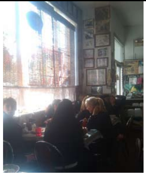
Big Breakfast at a little dinner in South Boston after a long red eye flight. Pretty normal weekend for the Stanford Sailing Team

Atlantic Coast Women's Championship qualifier for NEISA so competition was tight. Stanford came 10th in A Division and 4th in B Division to round out at 8th place overall. We felt that most races went well but some mistakes in both divisions dug us a couple of deep races.