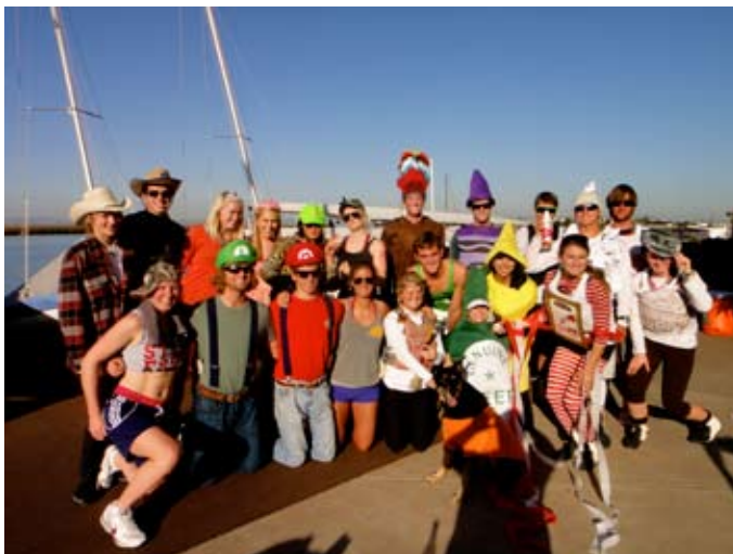
Great costumes at the annual Halloween 2 vs. 2