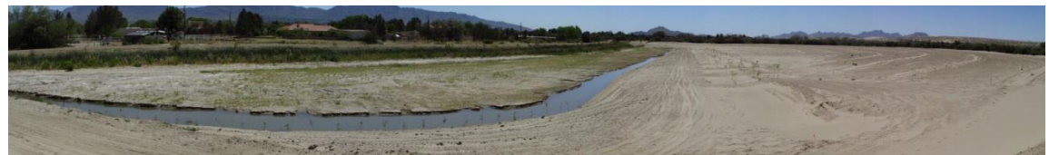
Sunland Park Urban Test Bed