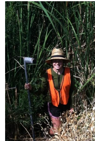
Collecting water samples from main drain