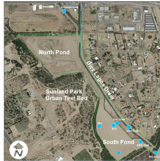
Sunland Park Urban Test Bed Site Map