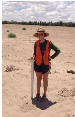
Completed piezometer installation