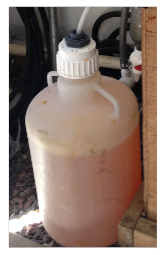
Figure 1: Ferric chloride feed reservoir