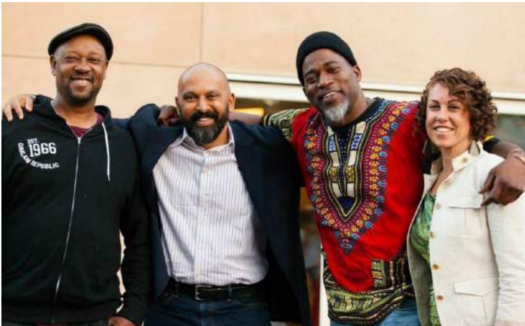
The Program in African & African American Studies Stanford University