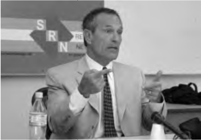
PHOTO: California Secretary of Education Alan Bersin speaks at a press conference following his institute presentation, "Restructuring the Central Office: Essential Conditions for Reinventing High Schools."