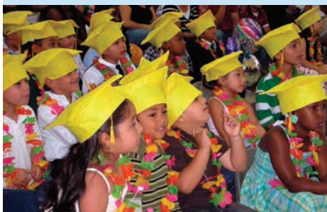
Kindergarteners at East Palo Alto Academy: Elementary School wait eagerly for their diplomas at their graduation ceremony in June. Nearly all of the school's kindergarten graduates have returned this year for first grade.

In August, East Palo Alto Academy: Elementary School (EPAAES), the K-8 component of the K-12 charter school run by the School of Education, opened its doors to 215 new and continuing students in neighboring East Palo Alto. Now in its second year, the school continues to work closer to its goals for every student in kindergarten to be proficient in literacy and mathe-