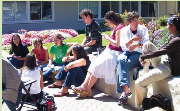
A group of STEP Elementary '06 and '07 alumni meet during a break out session to discuss issues facing elementary education teachers in the classroom.

Part of the Ravenswood City School District, East Palo Alto Academy: Elementary School has an enrollment that reflects the community’s demographics, including 63 percent Latino, 26 percent African American, 9 percent Pacific Islander, 1% Asian Indian, and 1% White. Ninety percent of the district’s students are classified as low-income, seventy percent of the school’s students speak a language other than English at home, and two-thirds of the students’ parents have not finished high school. SE