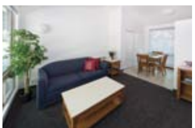
Escondido Village living room

apartments, which each include a kitchen with built-in eating area, a pantry, bathroom, and two private bedrooms. All Escondido Village apartments, with the exception of the two-bedroom, triple occupancy units and the new premium studio in the Kennedy Graduate Residences, are included when you indicate on the housing application that you are willing to be assigned anywhere.