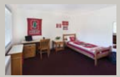
Escondido Village single bedroom

Student housing charges generally fall below local area rents, which rise in a tight market but seldom drop when inventory increases. Also, unlike most off-campus housing, Stanford housing rates and other fees include furnishings, utilities, phone, internet, coinless/cardless laundry, access to computer clusters, and common rooms such as lounges and game rooms in most complexes. Both academic year and yearround contracts are available. Housing charges, along with house dues and a communications fee, are billed each quarter. If you receive a salary through Stanford Payroll, you can make payments through payroll deduction.