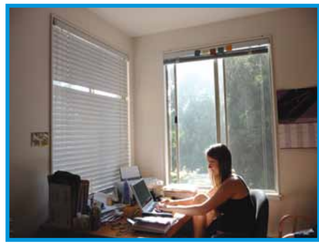
Student studying under natural daylight to save energy