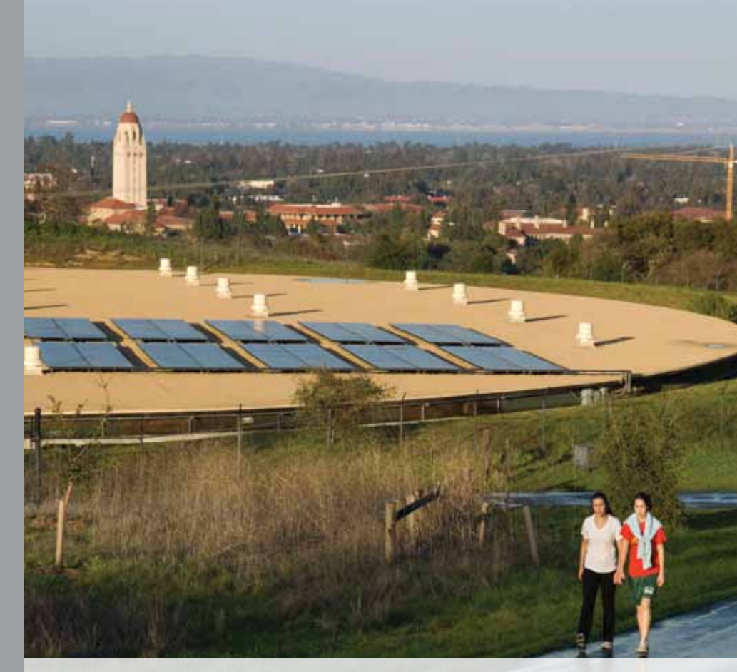
Your guide to an eco-friendly collegiate lifestyle