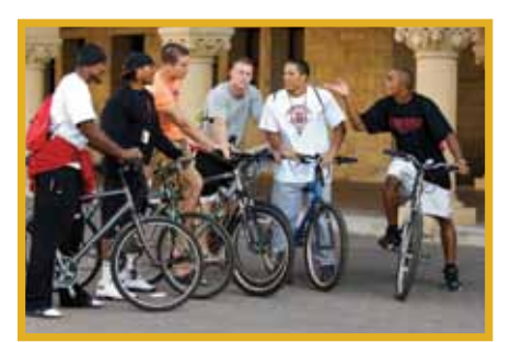
Students on bikes near the Quad