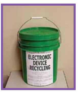
Electronics recycling bin