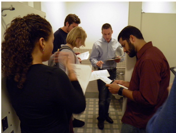
Students perform a water audit with SEM staff during the CEE/ES 109 course.

Are you curious about how an institution like Stanford integrates sustainability into its operations and culture? If so, sign-up for CEE/ES 109: Greening Buildings and Behavior this winter quarter. Co-sponsored by the Office of Sustainability and the Woods Institute, the course features an overview of operations-based sustainability via presentations from faculty and staff experts on energy, water, buildings, waste, and food systems, as well as hands-on, practical training to enable