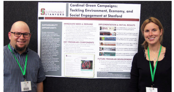
Office of Sustainability staff at the poster presentation for campus-wide conservation campaigns

Stanford representatives joined the record-setting 2,500 attendees at the annual Association for Advancement of Sustainability in Higher Education (AASHE) conference in October. The event provided an opportunity for Stanford to showcase the sustainability programs that make it unique, including the CEE/ES 109: Greening Buildings and Behavior course, campus-wide Cardinal Green conservation campaigns , and the business case for behavior-change programs. All materials presented during these well-attended sessions are now available on AASHE's Resource Center.