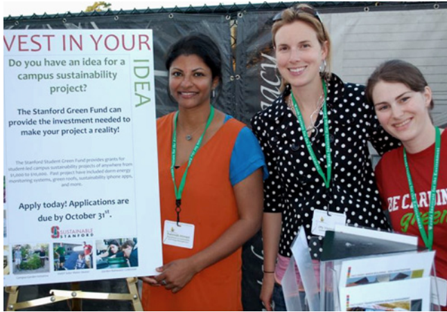
Office of Sustainability staff passed out t-shirts and fielded questions related to the Student Green Fund

On October 17th, 2011, hundreds of students gathered in the Y2E2 courtyard to learn about sustainability-related majors and departments, sustainability student groups, and sustainability grants, internships, and research opportunities. The