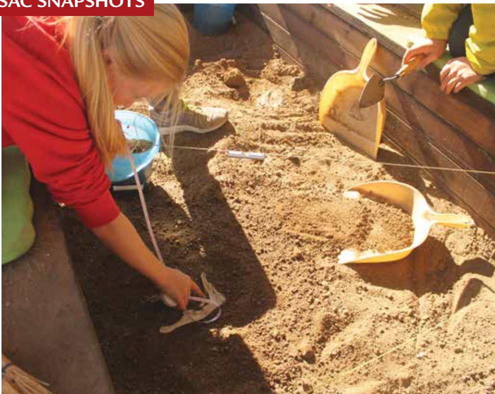
6th graders from Castilleja (Palo Alto) participating in the Big Dig Archaeological Outreach Project.