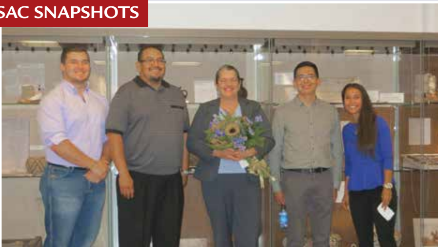
Native Collections Collaboratory exhibit at the Stanford Archaeology Collections grand opening