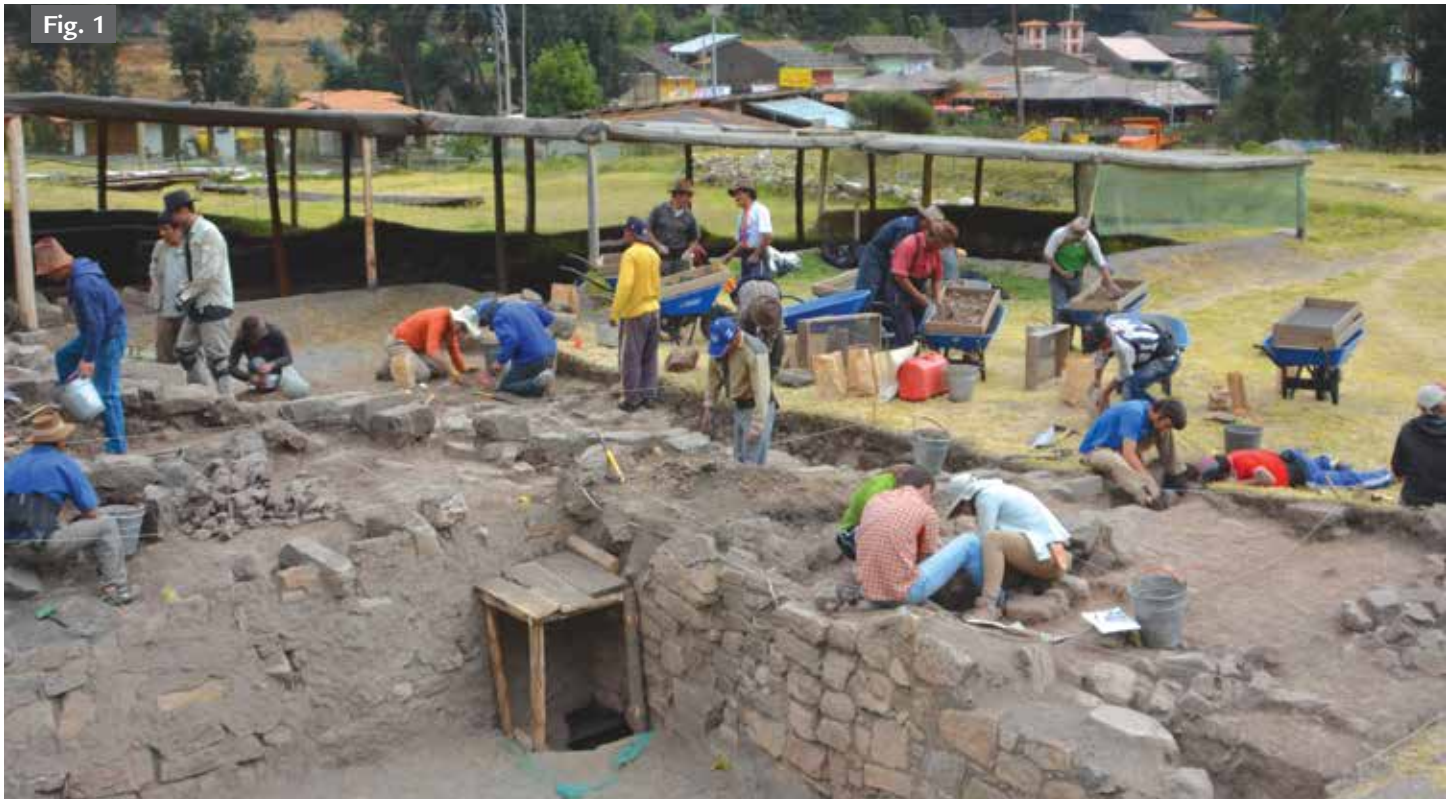
Fig. 1 Excavation of Chavín de Huántar, 2014: working on the north esplanade of Building C. Entrance to new subterranean gallery in the middle foreground.

Some of our more spectacular finds came from a narrow space between two of Chavín’s monumental buildings, in progressive excavation over three years. The total sediment depth will be well over 30 feet before we finish – this represents soil layers built up over more than 3000 years, separating materials from many more sequential strata than we usually find. We have now reached the floors of the passageway that ran between the buildings in Chavín times – one of the few entrances into the central Chavín temples. This access was further restricted by an entrance structure, and a sequence of sub-floor canals were run through this gateway space. The many layers left in this area in late Chavín times (1000-500 B.C.) were charged with elaborate, sacrificed ceremonial artifacts, many made