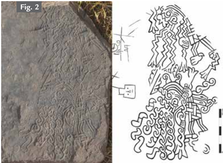
Fig. 2 Chavín-period engraved slate plaque found in the 2014 season, showing two deity-like entities bearing staffs, and emitting water-like scrolls (lower entity, with female signifiers) and lightning-like zig-zags (upper entity, with newly-identified male signifiers) from their mouths. | drawing by Miguel Ortiz.

Novoa, an experienced Spanish director documented our excavations and Chavín as it exists today, but also did creative but well-researched recreations of Chavín ritual life, complete with 200 extras, elaborate costuming and spectacular staging that evoke awe-inspiring visions of what dramatic ceremonies of 3,000 years ago were like. Watch for the release of the film in the first half of 2015, distributed by National Geographic. ■