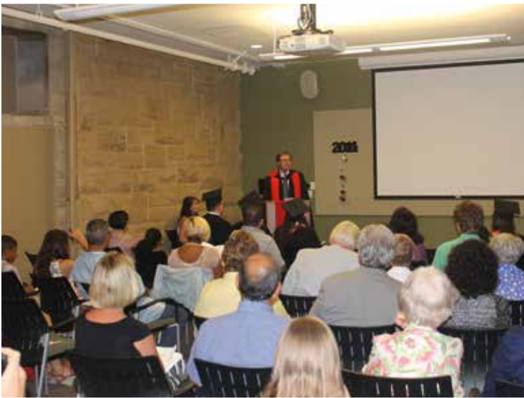
Professor Ian Hodder giving the welcoming address at the Archaeology Diploma Ceremony.